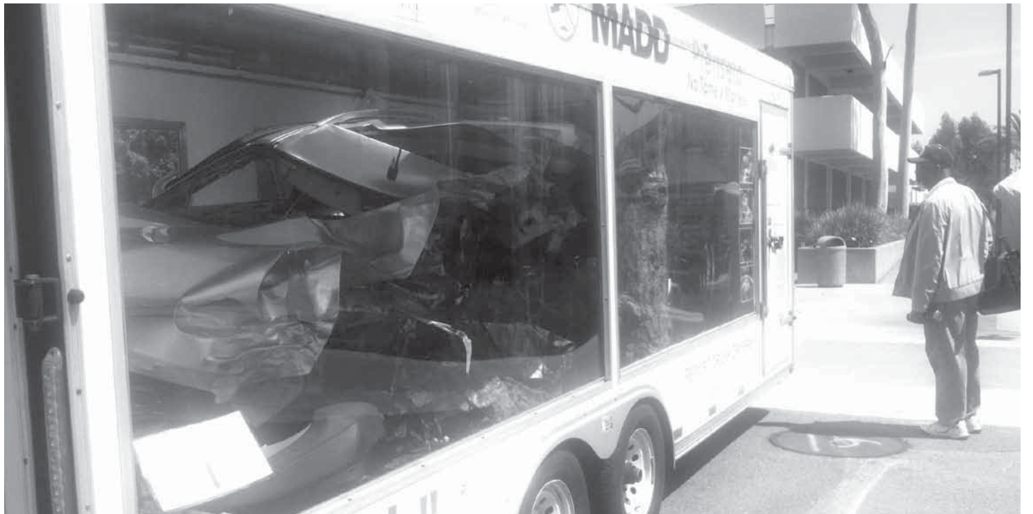
On April 3, the El Camino College Police Department, in conjunction with the Avoid the 100 West DUI Taskforce, sponsored the DUI Awareness event at El Camino College. Members of 12 South Bay police agencies talked to students about the dangers and consequences of driving under the influence just in time for spring break. Seen here is a "crash car" that was involved in an alcohol-related death, which delivered a strong visual impact to students of the direct result of driving under the influence.