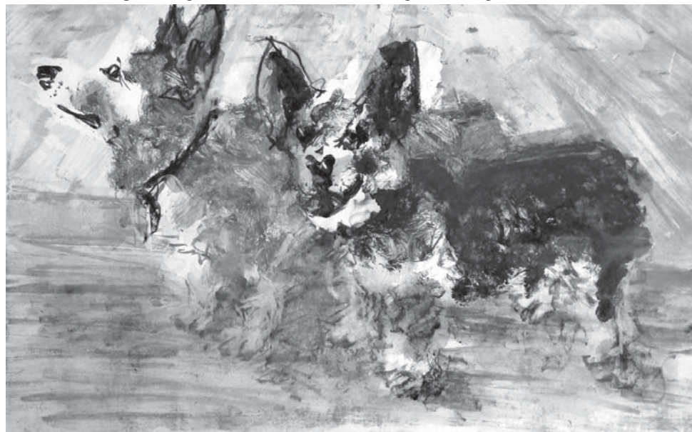
Capturing the personalities of loved companions in a commissioned pet portrait.